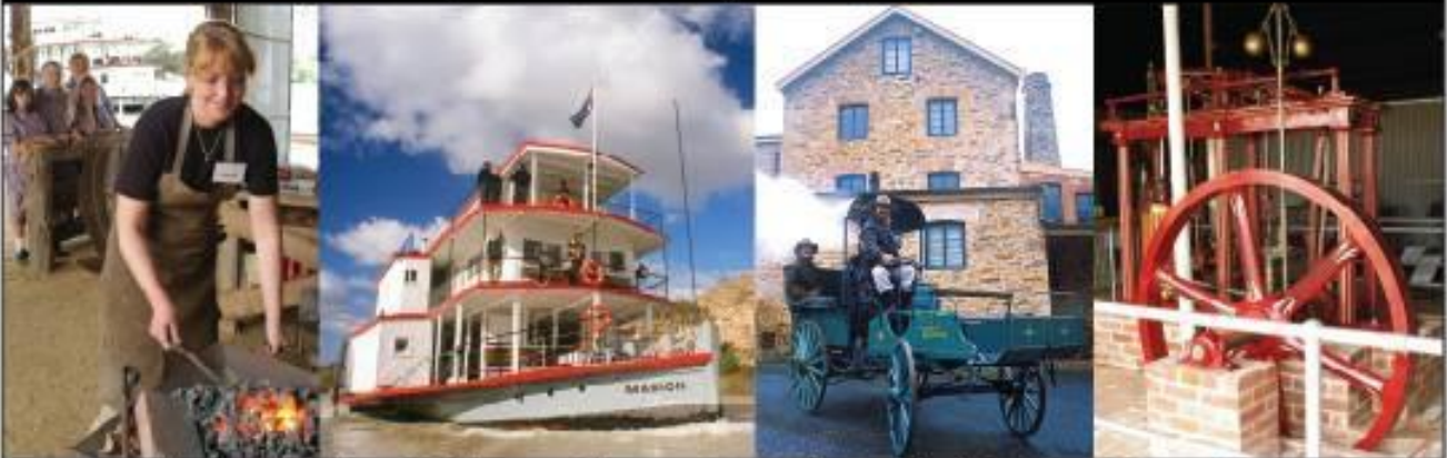
Blacksmith Shop, PS Marion, Shearer Steam Car, John Key Beam Steam Engine

Stationary Engines, Black Smiths & Mannum Fresh Water Classic Boat Festival Celebrating the 20th Anniversary of the recommissioning of the PS Marion Saturday 15th & Sunday 16th November 2014