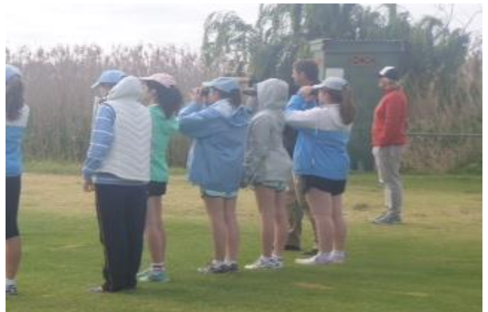
Looking through binoculars at Narrung Pier.