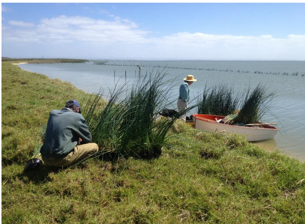
Photo taken at Point Sturt on edge of Lake Alexandrina

You can view the clip at 9adelaide.com.au/?page_id=111#prettyPhoto[gallery]/2/ .