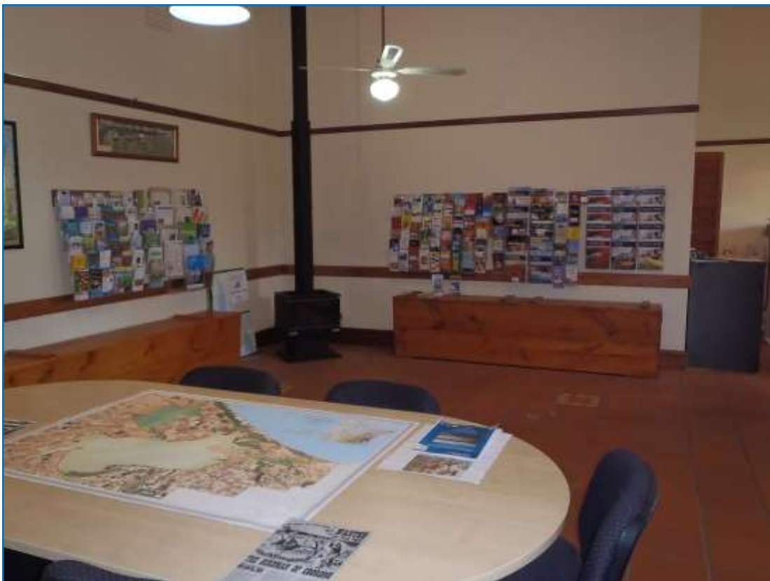
Lakes Hub Meningie “The Chambers”—14 Princes Highway Meningie 08 8575 1830