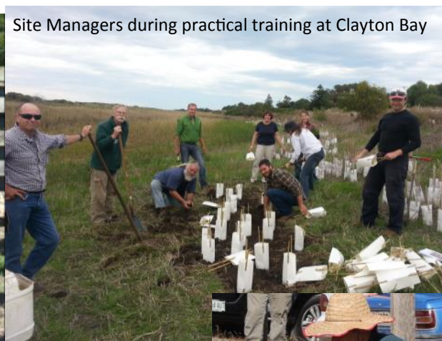
Site Managers during practical training at Clayton Bay