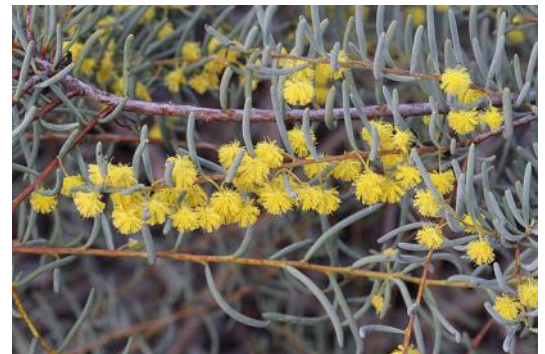
Acacia pinguifolia (Fat-leaved Wattle)

Students from Eastern Fleurieu School Strathalbyn gave their mothers local native plants for Mothers Day this year. The school partnered with Natural Resources SA Murray-Darling Basin Board, and were provided with 60 endangered plants including Fat-leaved Wattle ( Acacia pinguifolia ) and Silver Daisy-bush ( Olearia pannosa ) to present to their mothers on Mothers Day. The plants were raised from seed by the Clayton Bay Community Nursery from seed collected at Strathalbyn and Finniss where the endangered species occur naturally. The Silver Daisy-bush is listed as nationally vulnerable with only 1,000 individual plants remaining in SA, while the Fat-leaved Wattle is nationally endangered with less than 130 plants remaining in the area.