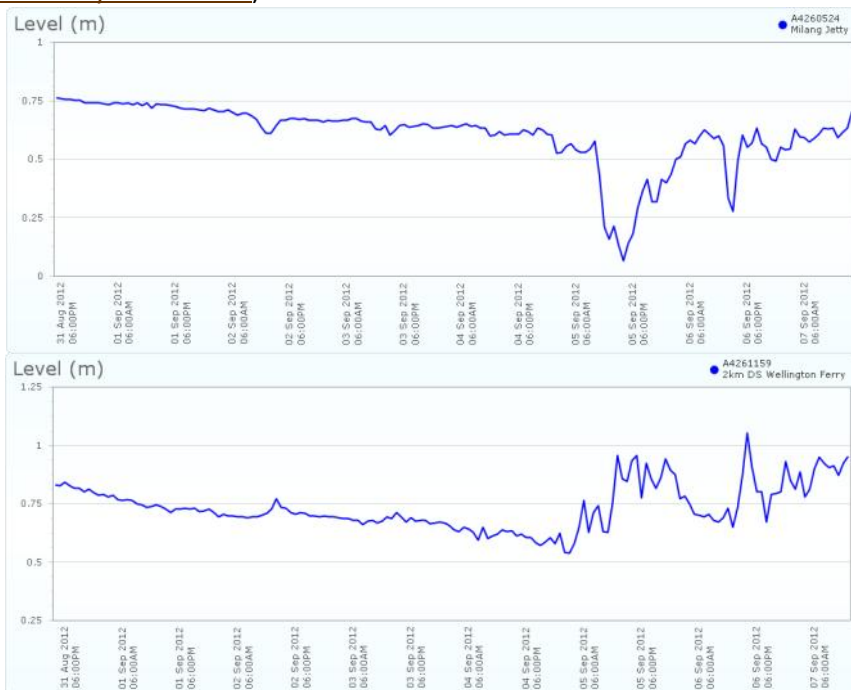
Data showing the displacement of water from Milang up river to Wellington

The lake levels are very telling particularly across Lake Alexandrina, where the wind's push of the water across such large distance shows just how the Lakes got their nickname of the "lungs of the river", pushing vast amounts of water up into the river, to flush back out again. (graphs generated from River Murray Water Data )