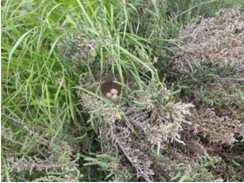
White-fronted Chat nest taken at Waltawa Swamp.

Reference : Natural History of the Strathalbyn & Goolwa Districts, by the Strathalbyn Naturalists Club Inc.