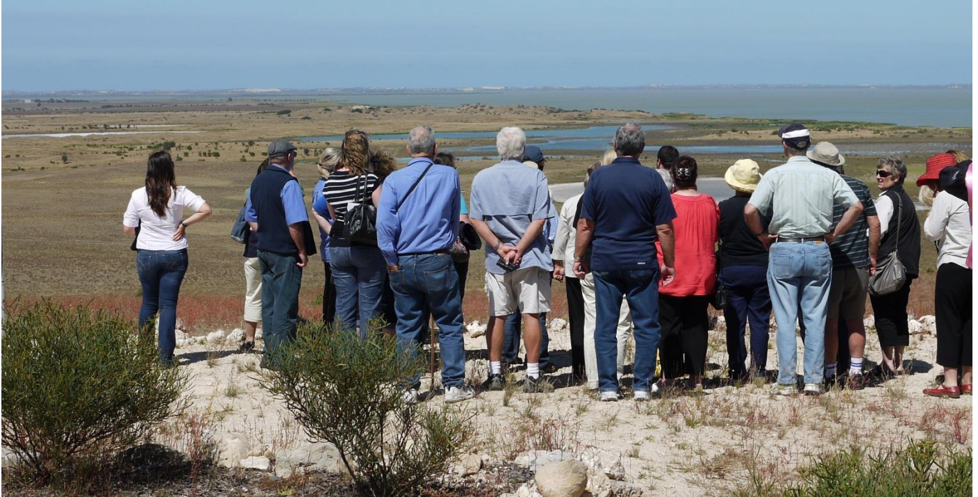
The view from the Teringie viewing platform at Raukkan. Should you wish to visit this are please call in at the Raukkan Council Office.

An inspection of the Raukkan community nursery followed where local, native, plant species are propagated for planting out in local revegetation projects. The tour then wandered up to the Raukkan church which is pictured on the Australian $50 note before heading up to Raukkan's Teringie wetland lookout .