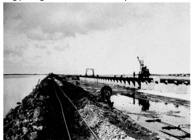
Tauwitchere barrage under construction 1935

Today the barrages are owned by the Murray Darling Basin Authority and operated by SA Water. Recent improvements to the barrages have seen a rock ramp and vertical slot fish ways included in the structures to help native fish species travel between fresh and sea water. Some remotely operated hydraulic gates have been fitted to the barrages to help expedite the opening and closing of the barrage gates as the needs arise.