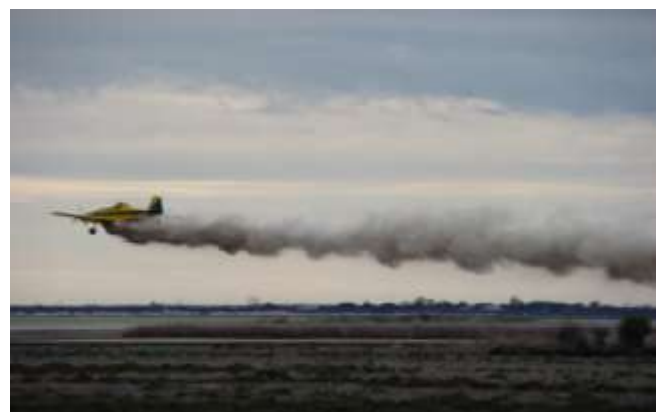
Aerial Limestone dosing

Aerial seeding for the 2010 season has been completed by Rural Solutions covering an area of approximately 5500 ha with predominately cereal and native Rye species as a mechanism for soil stabilization. RSSA have also conducted an aerial lime dosing program to stabilize acid soils along with a variety of other 'on ground' activities.